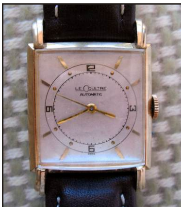
A 1950 Le Coultre automatic. This is a rare small size square wristwatch equipped with an automatic movement. This particular model was made especially for the American market. It competed with similarly shaped, but hand wound, Hamilton Elgin and Illinois wristwatches, which were quite popular at the time.

spirit of its owner. A unique experience provided by no other personal object. When one examines a true horological masterpiece, one does not only appreciate the aesthetics of its creation, but through it, one becomes keenly aware of the irreplaceable value of time itself. There are no doubts that the Swiss deserve much credit for being the great masters of the wristwatch golden age. The photos represent several examples of Swiss horological masterpieces. ■