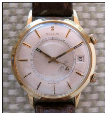
A 1958 Jeager Le Coultre Memovox calendar automatic. It is elegant enough to be worn for many occasions and is equipped with JLC caliber 825 featuring the loudest alarm mechanism in any wristwatch. This particular timepiece was made for Gubelin, the Tiffany of Switzerland. Few pristine examples of it are still available today.

When no one can add, subtract, or alter anything from a work of art, without utterly destroying the unique spark that made it what it is, it becomes a true masterpiece. Like in any such art work, it is impossible to consider any