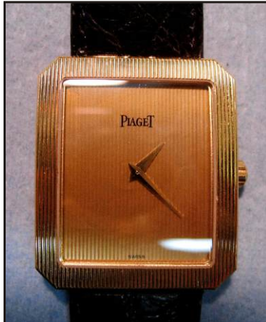
A 1963 Piaget Protocol. It is not only a refined and elegant wristwatch, but it is equipped with the famous, ultra flat Piaget 9P caliber, regulated in five positions. By a clever play of contrasting textures between the gold dial and the gold hands, there is no sacrifice in legibility. Notice the slightly curved case for outstanding comfort.

This applies to clocks as well as to watches. An art object possesses intrinsic value not only because of its visual appeal, but primarily for what it stands for, and for the quality of the craftsmanship that went into its creation.