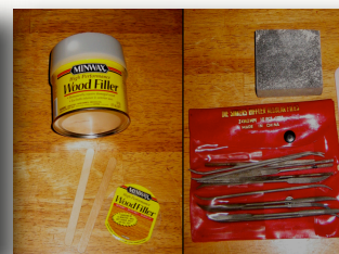
Recreate missing or damaged woodwork