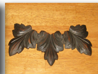
Including coloring to match