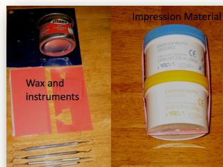
Explore waxing and impressions

Our last step will be matching the finish on the repair.