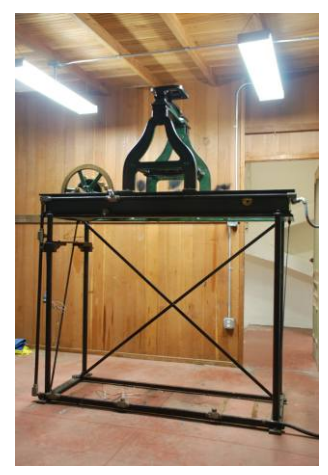
AS IT WAS