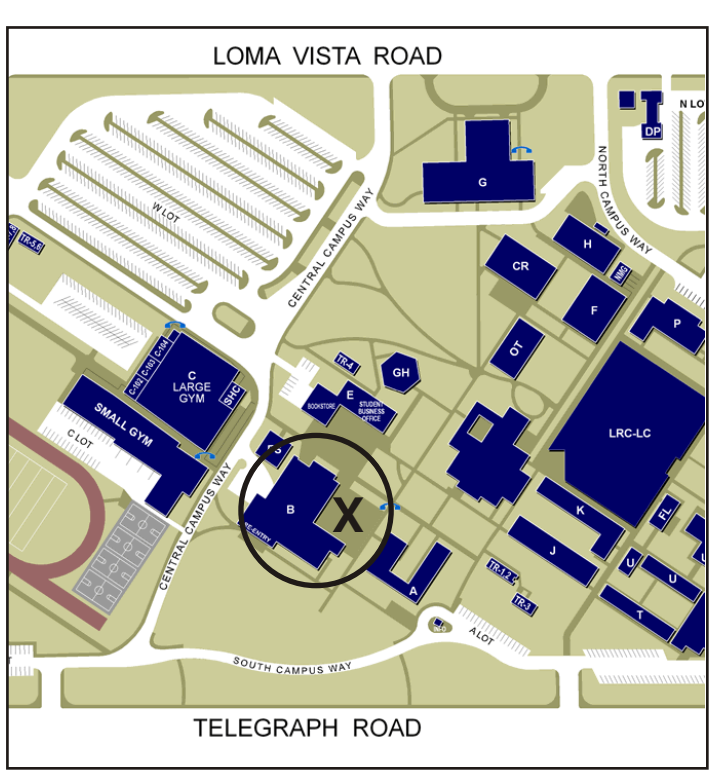
Hope to see you there!