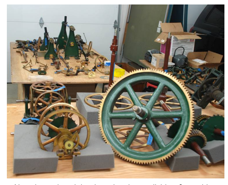
Now the real work begins, cleaning, polishing & repairing.