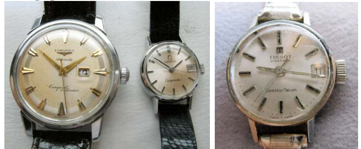
Left- Note the size comparison between a typical man and a ladies wristwatch of the sixties. Right- A Tissot Visodate Seastar ladies wristwatch, with calendar and a 17 jewel movement.

Historically, it should be remembered that wristwatches were initially crafted for women, while men, at the time, preferred to wear their pocket watches. It is during the First World War that men began to develop an interest in wristwatches, as a matter of convenience, for aviators and soldiers. Not long afterwards, most men abandoned their pocket watches in favor of wristwatches. Hence began the serious development and evolution of wristwatches that culminated in the nineteen fifties and sixties. The following are several examples of ladies mechanical wristwatches that were popular at that time.