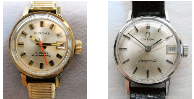
Left- A Signal, 17 jewels automatic, private label ladies watch, made in the Far East. Right- An Omega Ladymatic with calendar. It was one of the smallest automatics at the time.