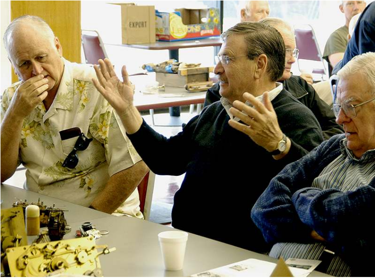
They don't seem to be buying Giorgio's fish story