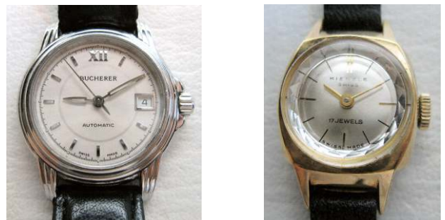
Left- A Bucherer automatic with calendar, very slim and waterproof with a screw in crown. Right- A Kienzle 17 jewels, elegant hand wound wristwatch from Germany. Swiss movement. ■